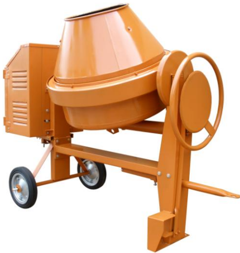
BS-360D / BS-360G