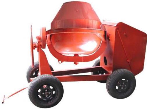
TK-7TM, optional with Pneumatic Wheel