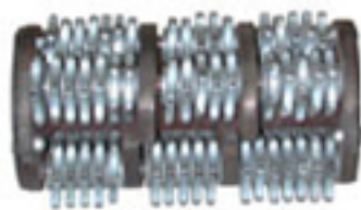
TCT-Tungsten Carbide Tips